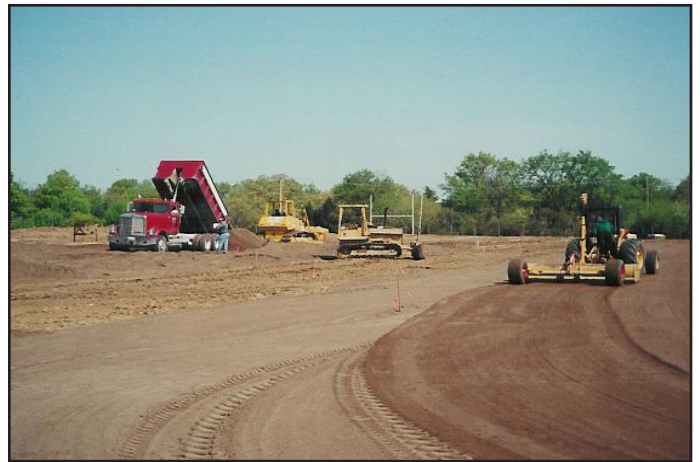
University of Missouri

During field construction, rough grading will take place when the contractor cuts and fills to level the subgrade of the field and establishes the proper compaction level requested by the planning engineer. High areas may need to be excavated, low areas may need to be filled to establish an appropriate grade. Providing the proper subgrade will impact the overall performance of the field. As mentioned, the main goal is to design a field to have minimal slope so the slope does not affect the play of the game, but still moves surface water from the field effectively.