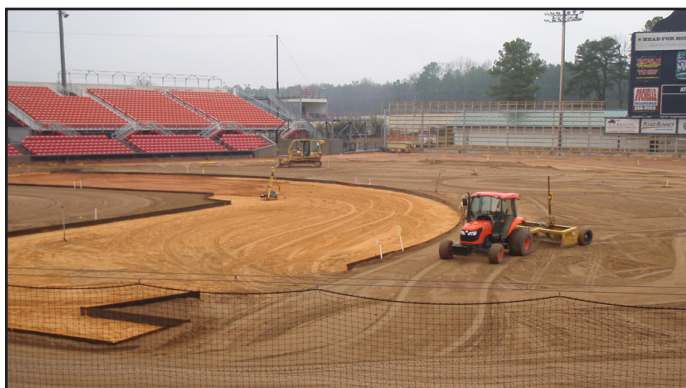
Laser Grading a Baseball Field

Laser systems can be automatic or manual. A laser controlled system automatically controls the grading machine based on the signal received from a laser beam. A laser indicated system requires the operator to read the laser indicator and operate the machine manually. Automatic systems offer reliable and precise results and protect against the loss of accuracy that human error can produce.