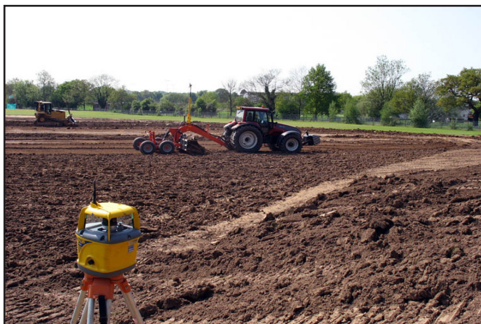
Laser Grading

Use a contractor that specializes in laser leveling to ensure the equipment and its operator are best suited to the project. Be sure the contractor is licensed and insured, familiar with materials, willing to coordinate delivery of materials with vendors in the area, and has sufficient experience in the business to provide referrals.