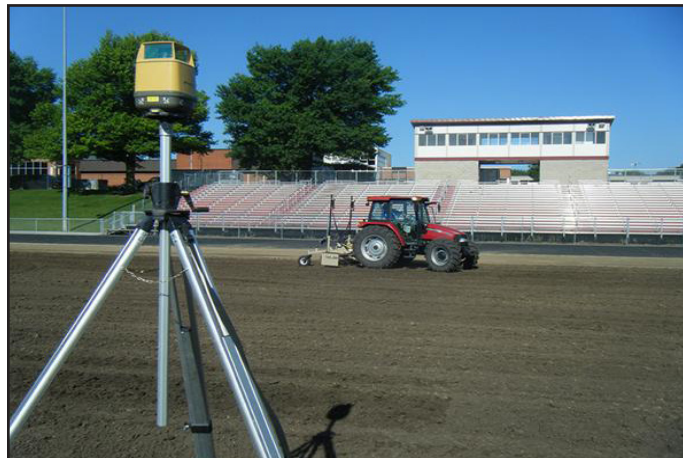
Laser grading a football/soccer field – Photo courtesy of Brad Fresenburg, Ph.D.

Regardless of the transmitter used, it is important to match the existing perimeter grades. It is at the operator's discretion how to set up the laser and how to tie into the existing elevations surrounding the field.